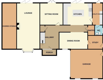
GROUND FLOOR 2055 sq.ft. (190.9 sq.m.) approx.