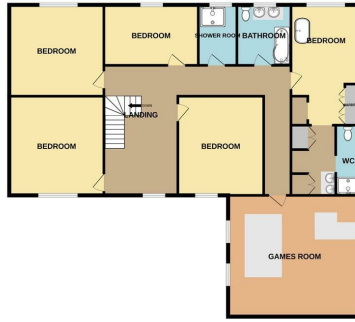
1ST FLOOR 1777 sq.ft. (165.0 sq.m.) approx.